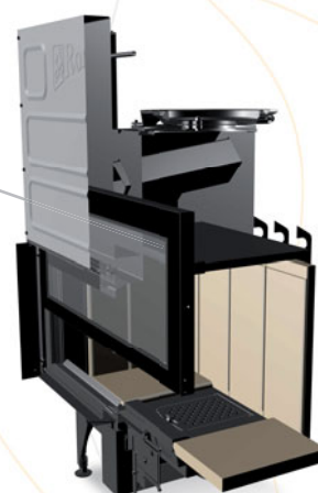
KV 055 AN/REDUCTION section

Design fireplace insert with sliding door including smooth stop and central air intake